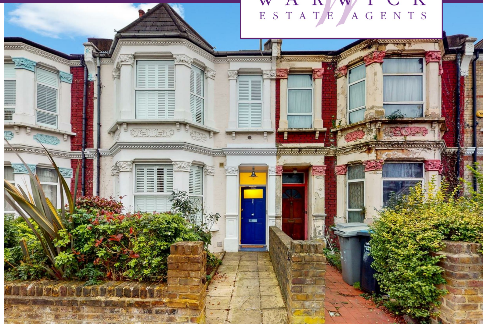
Harvist Road, Queens Park, NW6 6HB